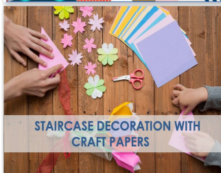
STAIRCASE DECORATION WITH CRAFT PAPERS